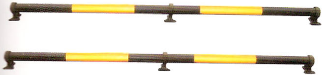
型号: CAS-DLG-1 品名: 挡轮杆 规格: \phi 2.0 \times 2000 \text{mm} \ \phi 2.5 \times 2000 \text{mm} \phi 3.0 \times 2000 \text{mm}