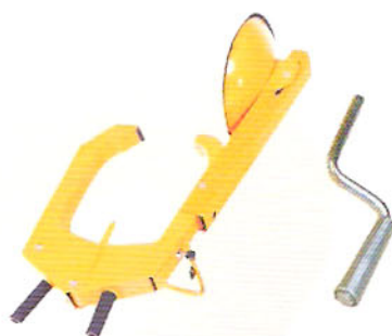
CAS-4 车轮锁 (大、小带报警器支架/漏气锥)