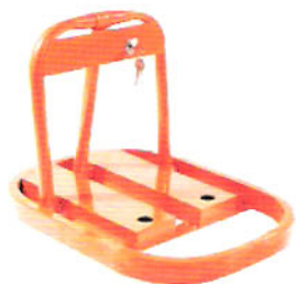
CAS-1 U型手动车位锁 规格: 620x460x45xh420