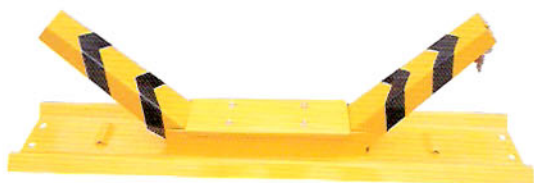
CAS-2 K型手动车位锁 规格: 1250x200x80xh480